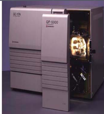
Shimadzu QP-5000 GC/MS