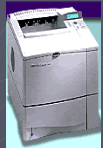
HP Laser Printer