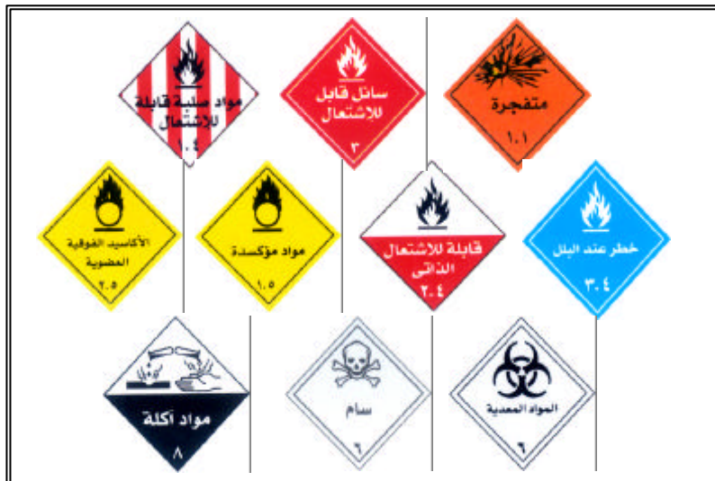
Figure (3) Hazardous Waste Transport Signs

In addition to the placards, the means of HW transportation are to have stickers placed on all sides, indicating that these means are approved and licensed for transporting HW. The stickers would also have inscribed the telephone numbers of the Civil Defense Authority, and the EEAA Contingency Plan Operation Room for rapid contact in case of accidents