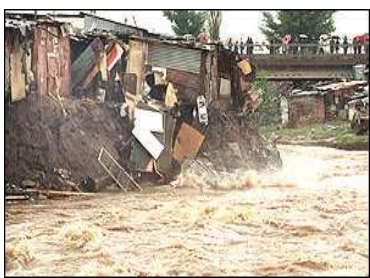
Mozambique Floods ~ 2000