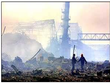
Toulouse, France ~ 2001