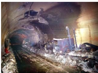
Mont Blanc Tunnel, France ~ 1999