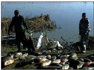
Baia Mare, Romania ~ 2000