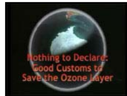
Nothing to Declare