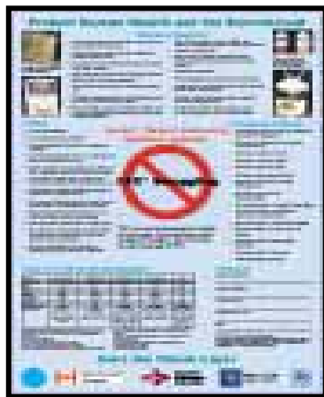
Customs Poster Against CFC Smuggling