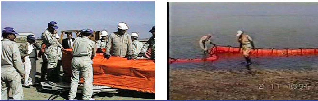
Picture (15-2) Practical training on marine pollution abatement in ports