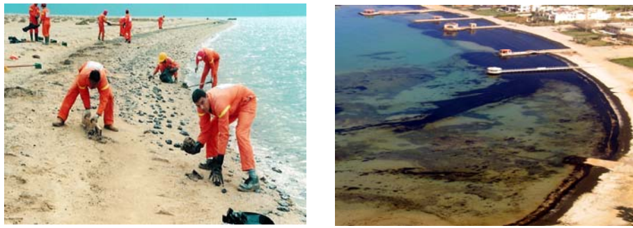
Picture (15-2) Practical training on marine pollution abatement in ports