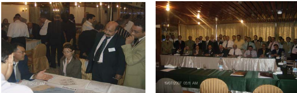
Picture (15-3) Participation in meetings and committees on navigational hazard reduction and marine pollution prevention