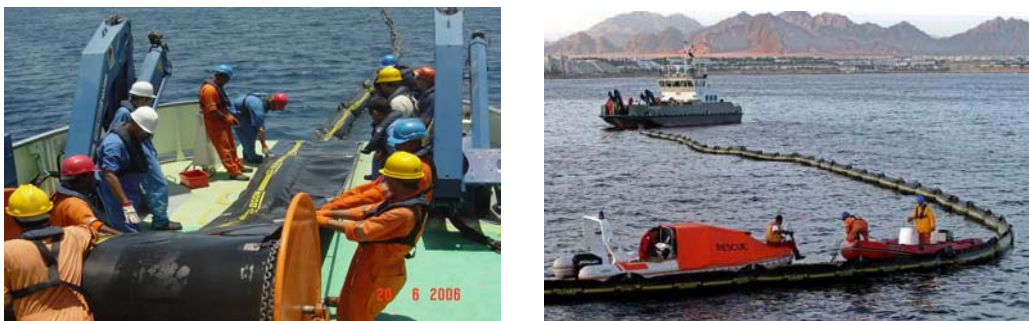
Picture (15-4) Following up management and operation of Marin Pollution Prevention Center in Sharm El-Sheikh

Doing field visits to follow up operations and maintenance activities of the Marine Pollution Response Center at Sharm El-Sheikh, and the co-trainings between the center and South Sinai Protectorates.