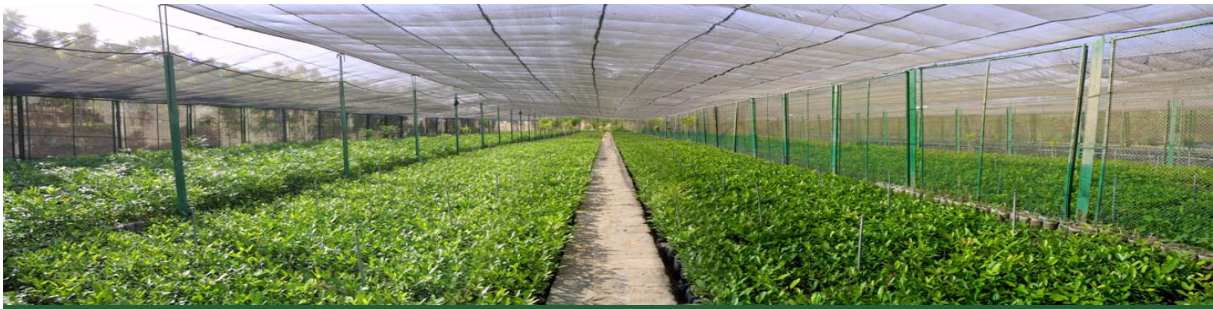
A nursery for producing Mahogany trees seedling at Luxor Forest, producing around one million seedlings per year