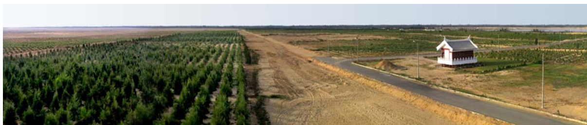
Egyptian-Chinese Friendship Tree forest at Sadat City

for afforestation Safe Use of Treated sewage water in cooperation with the Ministry of Agriculture and Land Reclamation (Undersecretary of State for Afforestation and Environment), the Ministry of Housing, Utilities and Urban Communities (MHUC), the Ministry of Health and Population (MoHP), the Ministry of Local Development (MoLD), the Ministry of Water Resources and Irrigation (MWRI) and Specialized Research Centers.