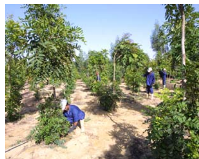
Workers in timber forests observe environmental