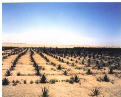
Agave sisalma in Ismailia Forest