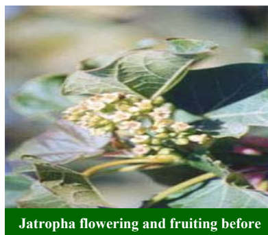
Jatropha flowering and fruiting before