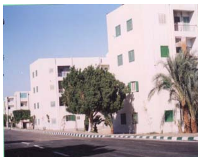
Tree planting in Environment Youths Neighborhood, El Kharga Oasis

Phase Four: Green belts around new cities.