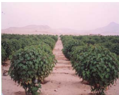
Jatropha curcas in Luxor Forest