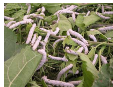
Larvae in the third stage