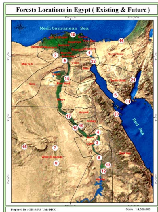
Forest-trees cultivation using wastewater