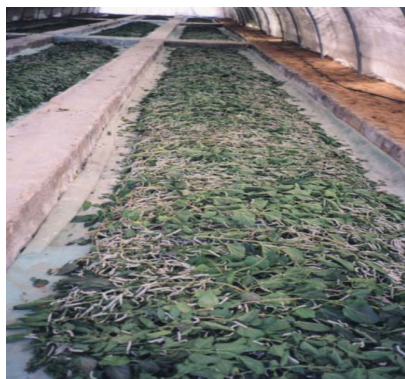
silkworms on mulberry leaves at Sarabium Forest in Ismailia