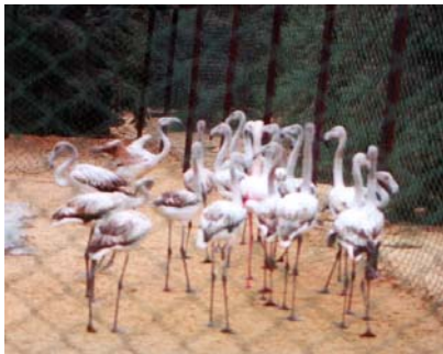
Flamenco at Sarabium Forest